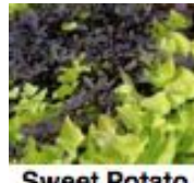
Sweet Potato Vine